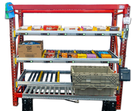
FastTrack V.2 pick-to-light system

Level helps you consolidate information from around your warehouse to truly understand and optimize your warehouse inventory and purchasing needs.